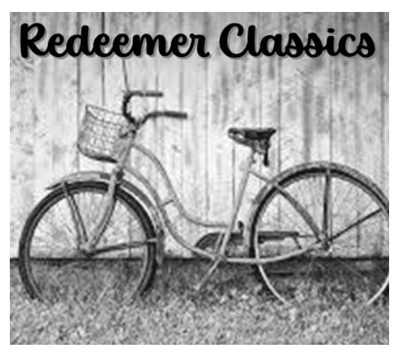
Redeemer Classics for October has been cancelled.

Volunteers Needed! Thank you to all who are helping on Tuesdays and Wednesdays! Due to a number of circumstances our biggest need now is a list of folks who would be willing to drive (occasionally) to Waco on Wednesdays and Fridays or to Second Harvest on Tuesdays. If you would like to be a part of this volunteer ministry please contact Deacon