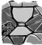
A world of endless possibility