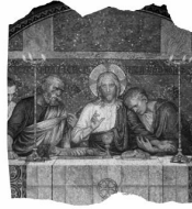
Origins, Development and Controversies