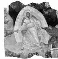
A Resurrection Feast