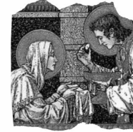
Receiving Holy Food